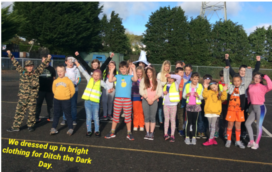
We dressed up in bright clothing for Ditch the Dark Day.